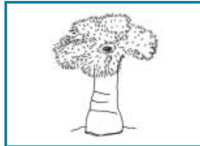
Northern sea anemone