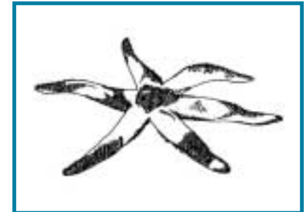
Polar sea star